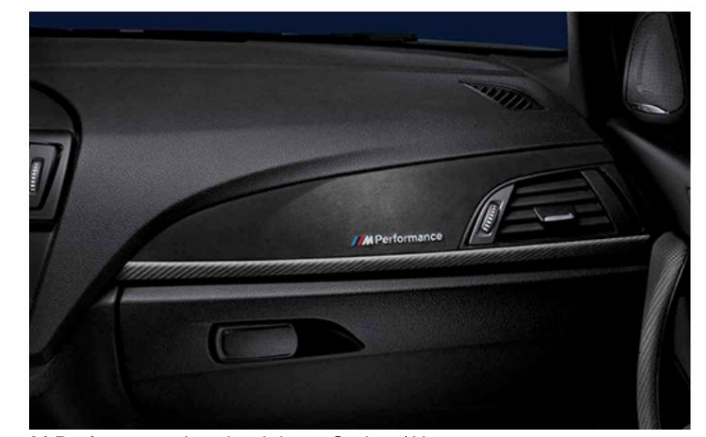
M Performance Interieurleisten Carbon/Alcantara

Other M Performance interior products such as steering wheel, Shift knob and handbrake handle with bellows, which are also in the Material mix carbon open-pored and Alcantara are kept.