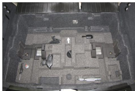
Crash-proof accommodation in the luggage compartment tub