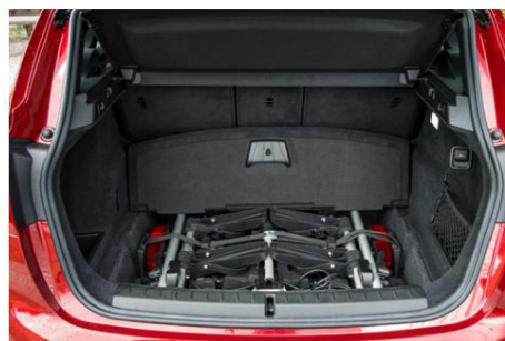
Rear bicycle rack stowed in the luggage compartment tub